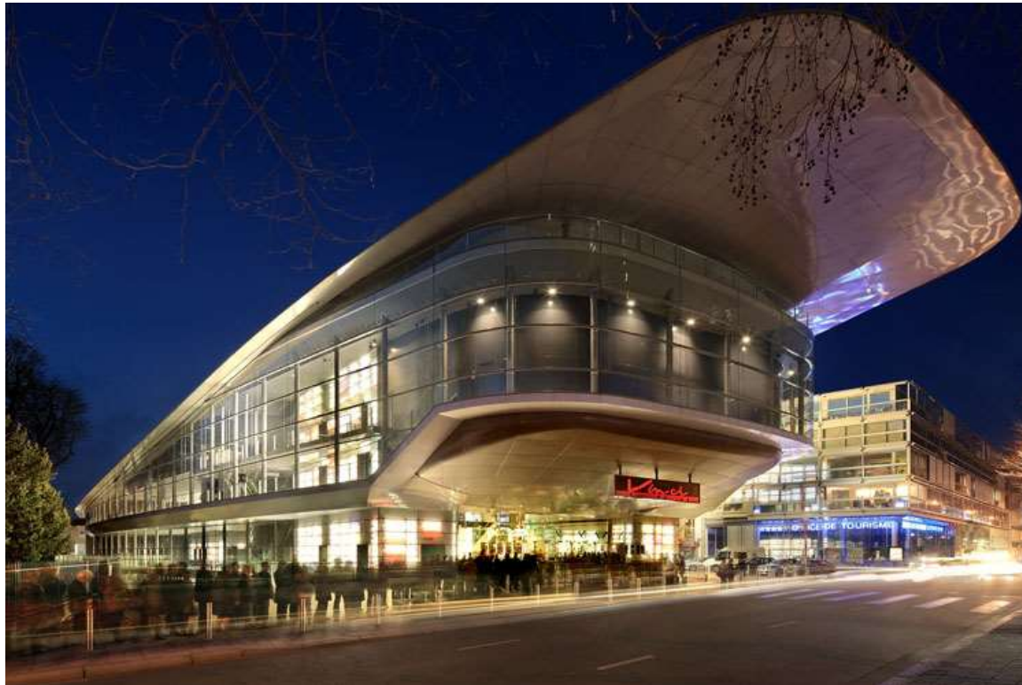
Centre international des congrès Le Vinci à Tours / J. Nouvel, E. Cattani

Le 26-28 Boulevard Heurteloup 37000 Tours